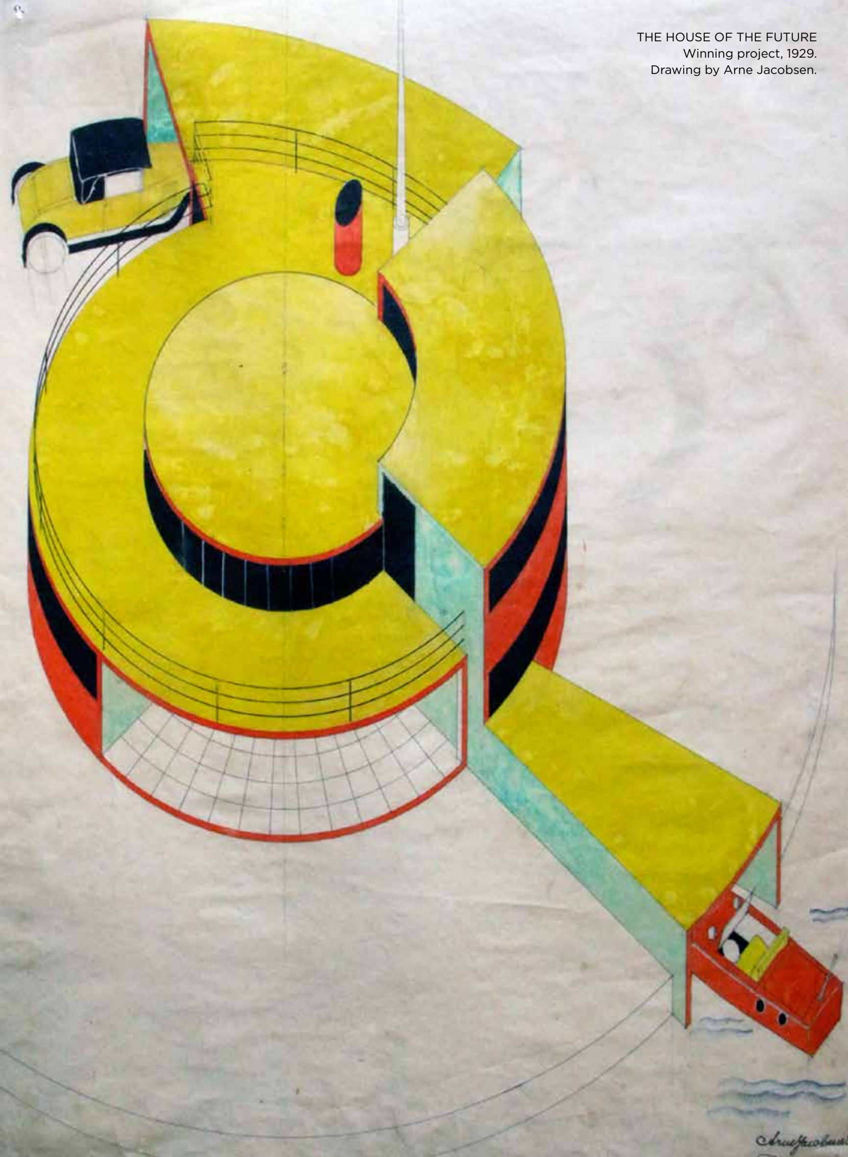
THE HOUSE OF THE FUTURE Winning project, 1929. Drawing by Arne Jacobsen.